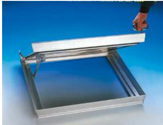
Detailed view of the safety device The cover is lifted by the hinge, significantly reducing the effort required.